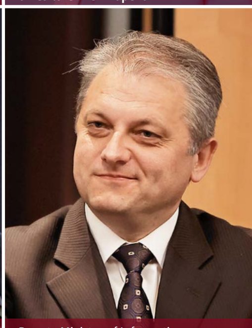
Deputy Minister of Information of Belarus I. I. Buzovsky