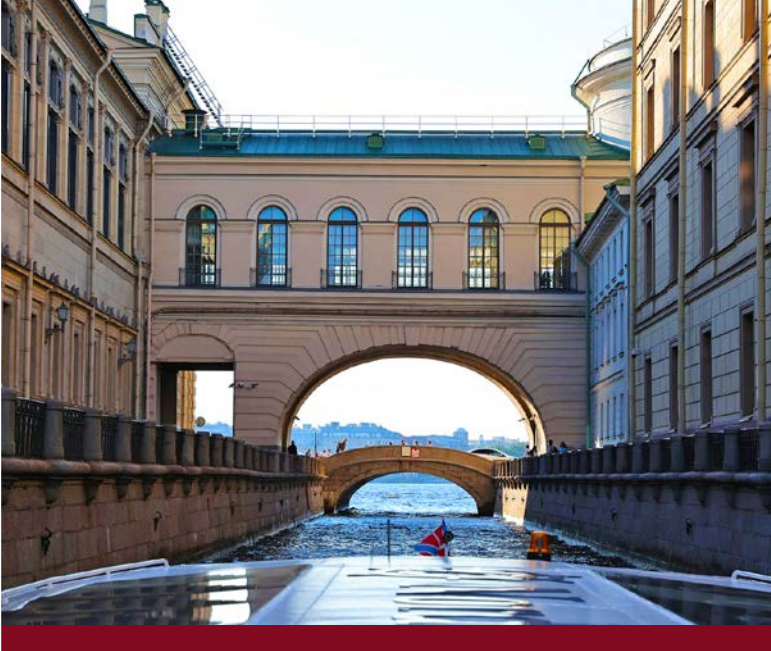
Cruise: the Neva outlet