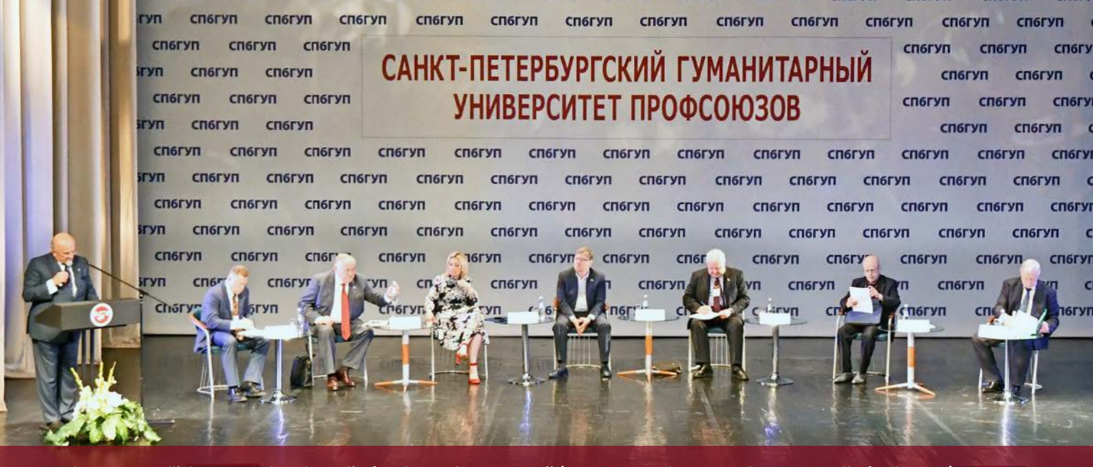
Panel Discussion "The Great Chessboard" of Today and Tomorrow" (A. P. Petrov Theatre and Concert Hall of SPbUHSS)