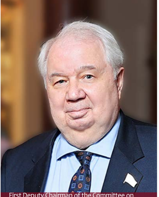
First Deputy Chairman of the Committee on International Affairs of the Federation Council, Ambassador of the Russian Federation to the USA (2008–2017) S. I. Kislyak