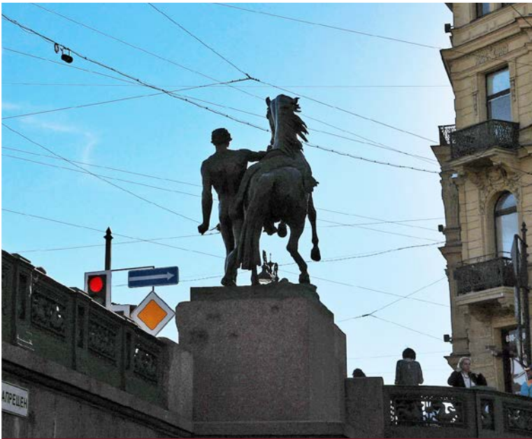
Cruise along the rivers and canals of St. Petersburg: Anichkov Bridge