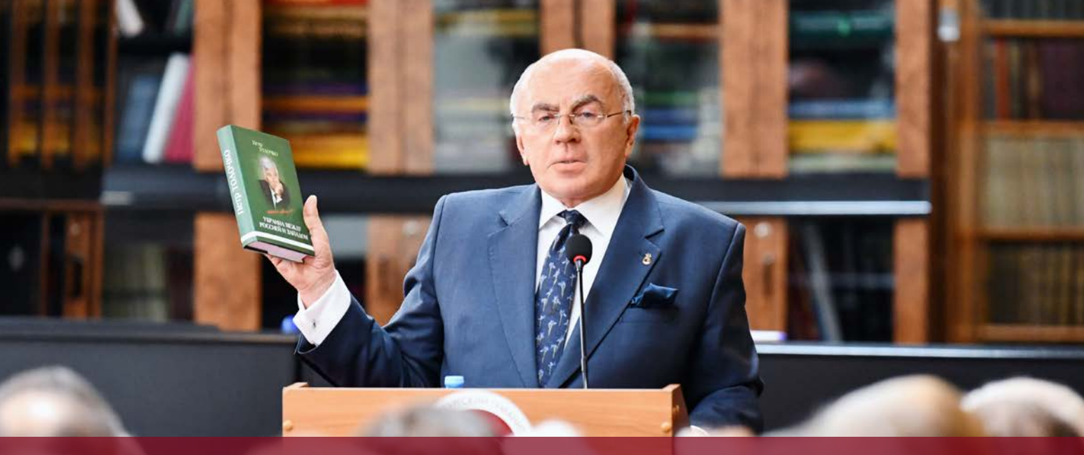
Presentation of the University's new editions at D. A. Granin Scientific Library in SPbUHSS